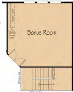
Optional Bonus Room