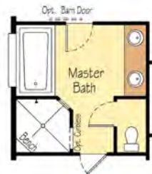
Custom Shaped Shower Option