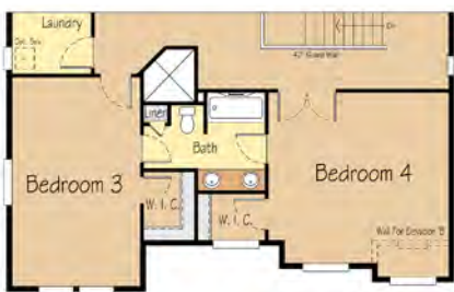
Optional Jack and Jill bathroom