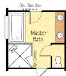
Glass Mud-Set Shower Option